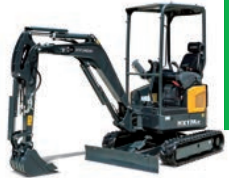
*HX17Az canopy shown

Our larger HX60A and HX85A come with ROPS cabins, and the ultra-compact HX17Az is a canopy machine. Depending on the climate and applications you work in, you can choose enclosed cabin or canopy versions of our other models. The cabin structure of these machines incorporates low-stress, high-strength steel to meet respective ISO ROPS and FOG certifications.